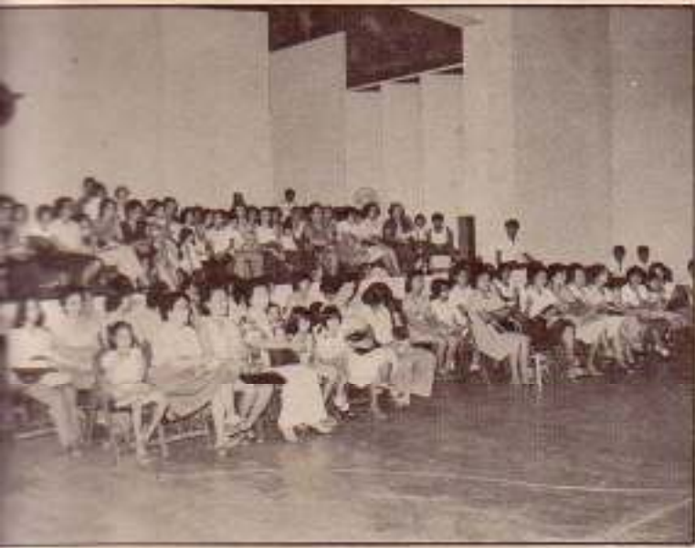
the spectators on stage . . . the first time