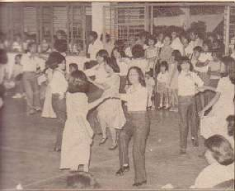
ing the square dance . . .