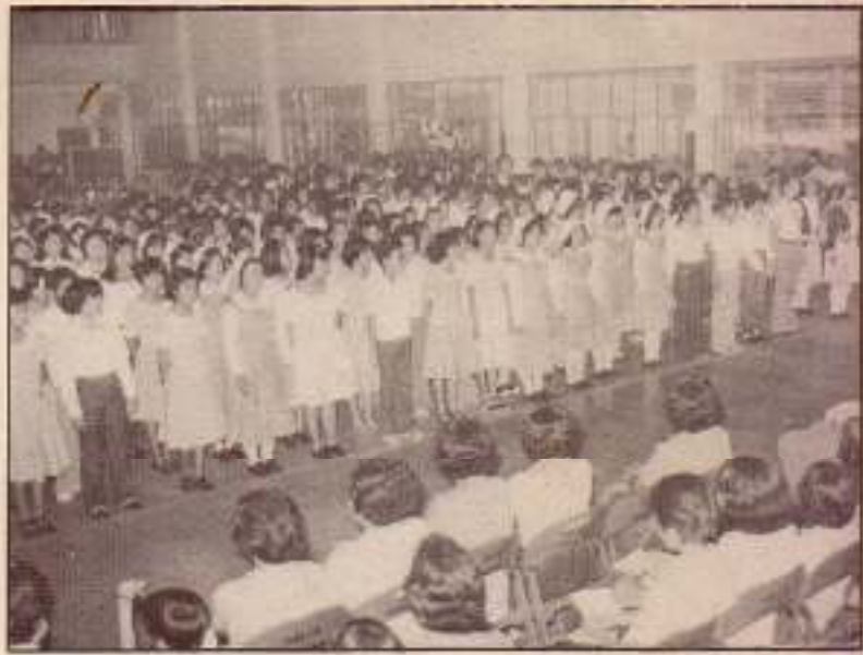
Some 500 voices of the high school students