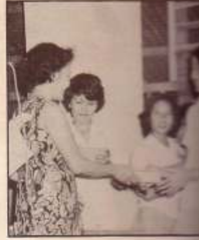
Naps – Biology (2nd)