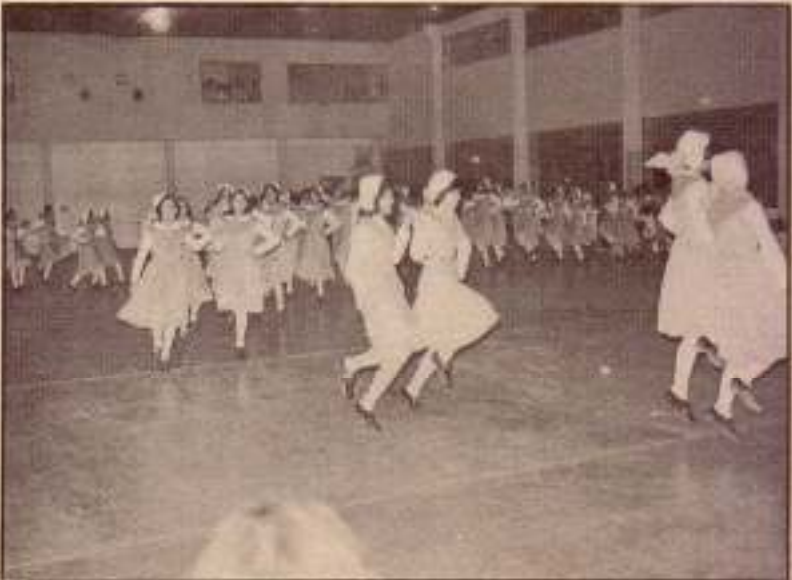
the European dance . . .