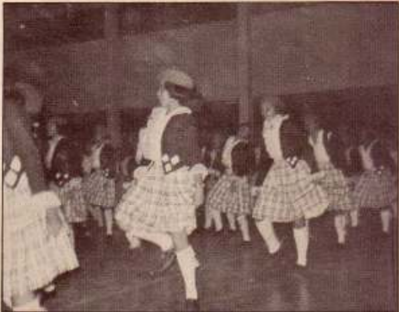
the Highland Fling . . .