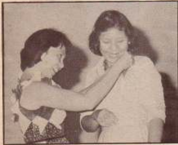
Marvs – Declamation