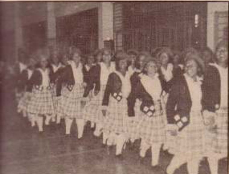
the Seniors !